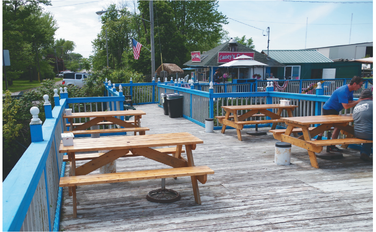
Outdoor seating is available on the deck at Casey's Cabana in Ferry Village.

Cuomo: Outdoor dining at restaurants permitted in phase two of reopening